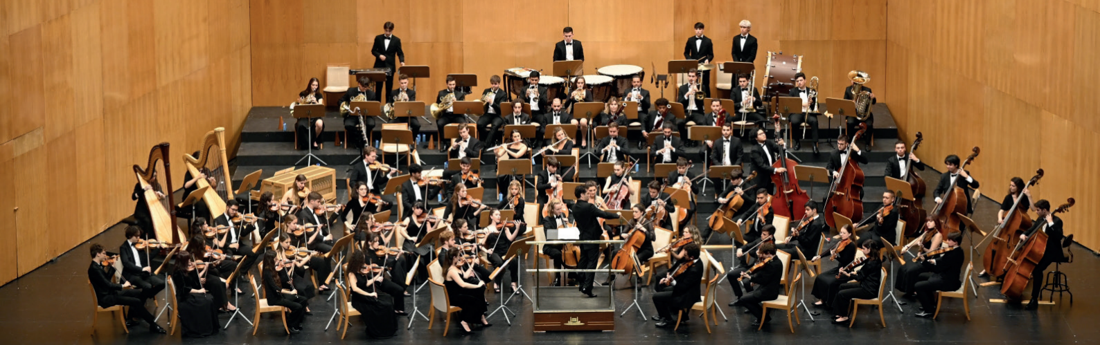
Andrés Orozco-Estrada with the Freixenet Symphony Orchestra. Inauguration concert of the 22-23 academic year. Palacio de Festivales de Cantabria, Santander. November 2022